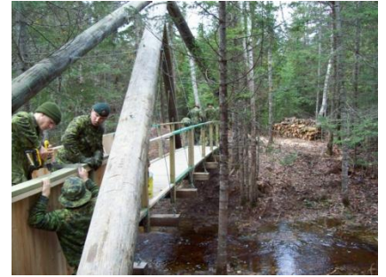
Working on the Suspension Bridge.