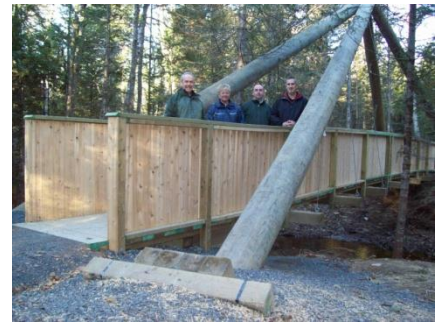
The Suspension Bridge “Community Spirit.”