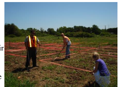
Working on the Community Garden.