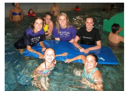
Day Camp Field Trip to the Saint John Aquatic Centre