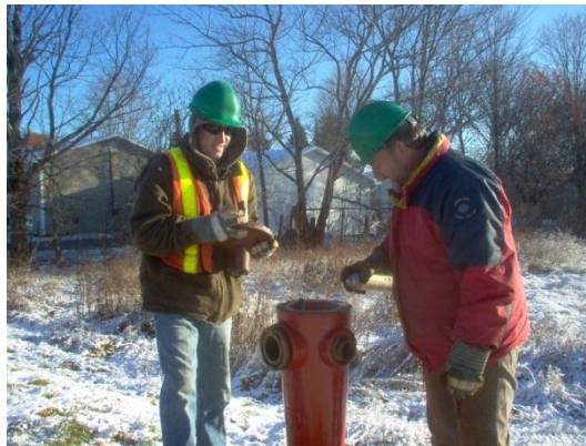
Staff working on maintenance of the new hydrant system