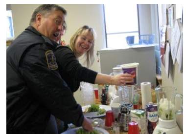
Staff enjoy Fruit Smoothies as part of Wellness Week activities