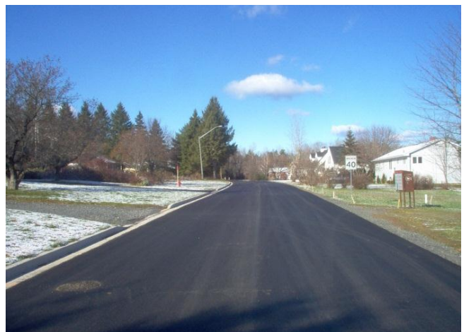
The work on Baker Brook Court, including upgrades to the sanitary, storm and water systems, as well as curbing and asphalt paving were completed.