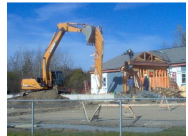
Village Office expansion project