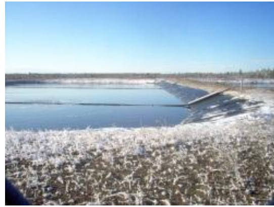
The Wastewater Treatment Plant lagoon system