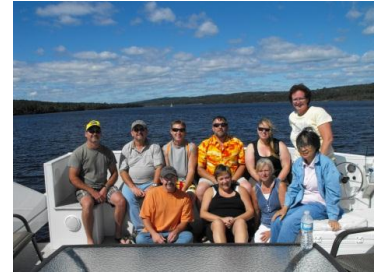
Staff get together for a summer outing