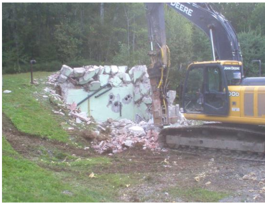
Gravenstein Reservoir Decommission and Demolition project

Chairperson Water & Wastewater Committee