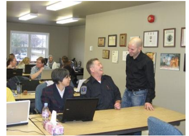
Staff and ERP committee members participated in training for the new Sentinel System.