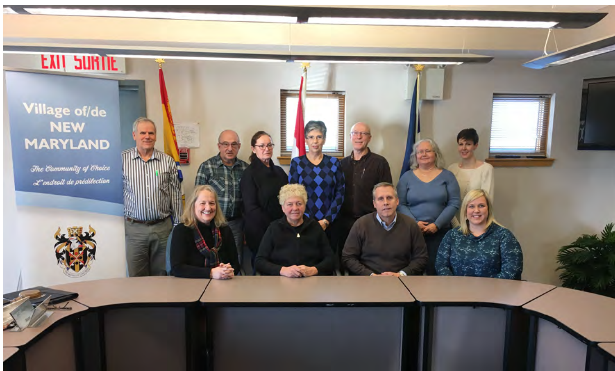
Age-Friendly Community Ad hoc Committee

A special thank you to all the members of the community who participated in the consultation process and provided valuable information and insight.