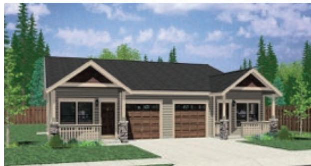
VONM Housing Market Opportunity – Semi-Detached / Row Housing