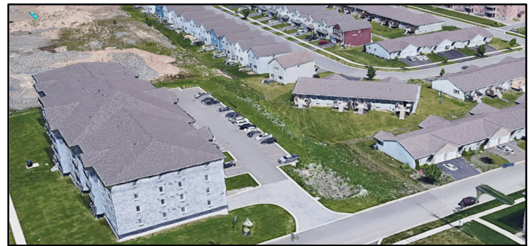
VONM Housing Market Opportunity – Apartment Buildings and Semi-Detached / Row Housing